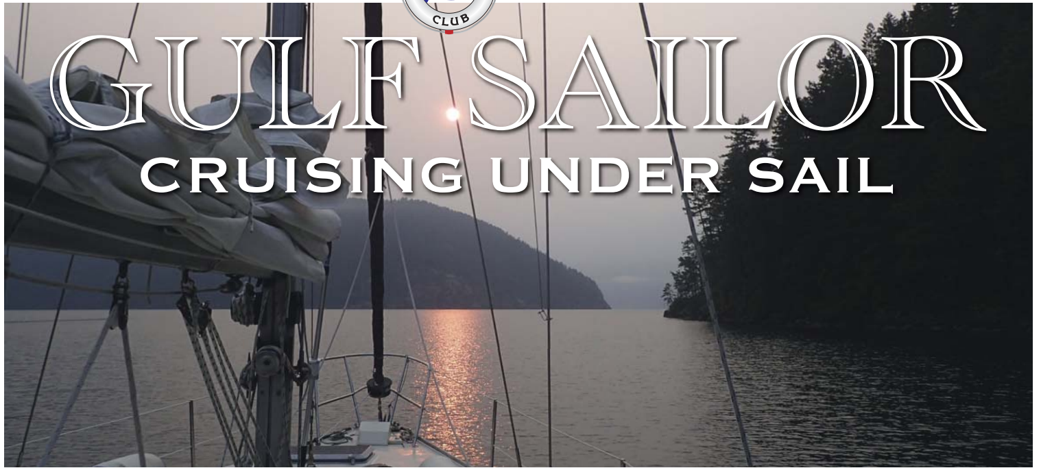
Heading out of Roscoe Bay as the sun rises in a smoky sky, August 2017.